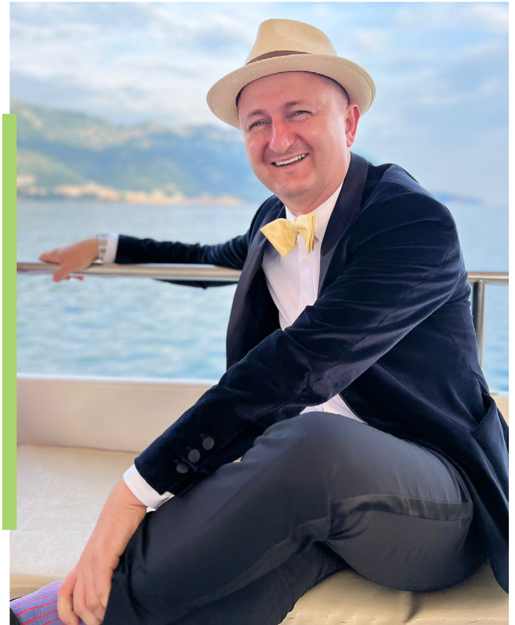
* Pictured in Montenegro at the Microfinance Center Conference, 2023