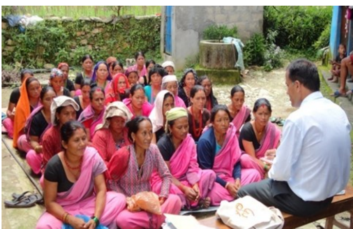
Illustration 1: Pre-group training in action

management. Potential clients discuss how to select and dismiss representatives, roles and responsibilities of group/center executives, and the importance of working together as group.