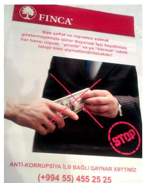
Figure 2: Anti-corruption poster

person will not be a good client in future. FINCA also looked at how often it collected written Management used case examples to show that complaint information. In the past, suggestion and clients complain when they care about the complaints box keys were held by only 4 senior staff who made infrequent visits to branches. Now, FINCA ensures that the boxes are opened more often: all midlevel managers making a regional visit can be assigned a box key. In this way, the boxes are opened almost every week.