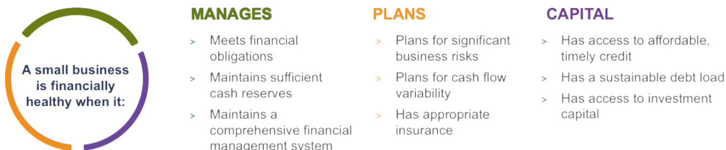
FIGURE 1: THE FINANCIAL HEALTH OF A SMALL BUSINESS