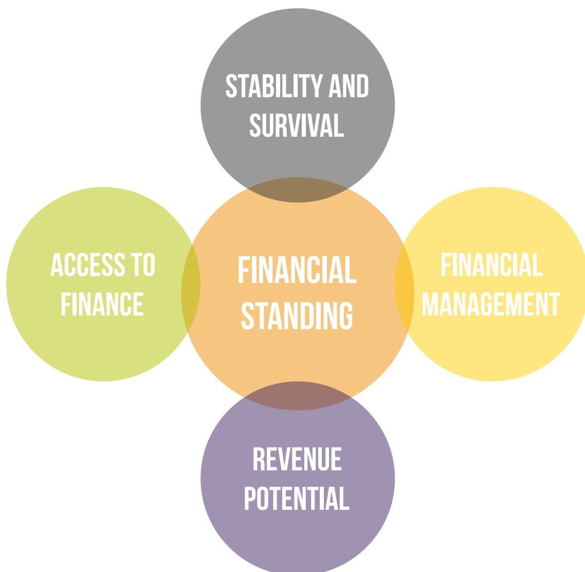
FIGURE 2: COMPONENTS OF THE MFC FINANCIAL HEALTH SCORECARD

The MFC's definition of financial health for a small business draws upon the FHN's definition and expands its scope to include (in addition to core financial indicators), access to finance and financial management capabilities, factors related to business stability, and revenue potential (see Figure 2).