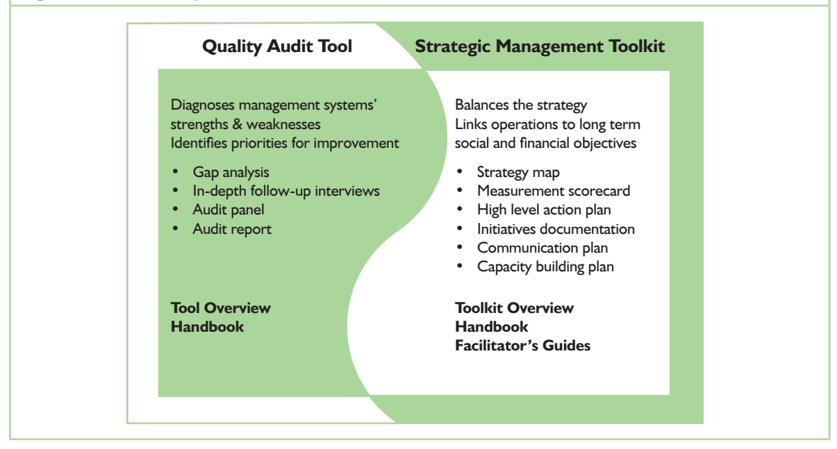
Figure 2 Tools Map

The From Mission to Action Management Series for Microfinance Institutions provides insights to balanced management practices. Its practical approach emphasizes hands-on engagement by MFIs and builds on what they already have and do in order to take manageable steps towards change. The Quality Audit Tool can be used to diagnose the current situation, while the Strategic Management Toolkit develops a roadmap to translate the mission into action effectively.